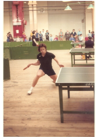
Do you know the name of this former Middlesex County Player?