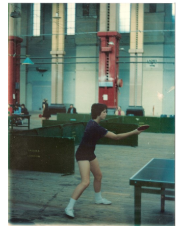
Do you know the name of this former Middlesex County Player?